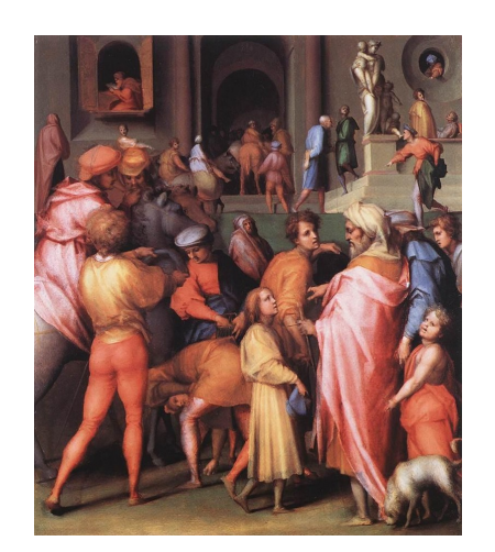
Joseph Sold to Potiphar

"God would use Joseph to save Israel so that one day Jesus would come from Israel's line and save us all."