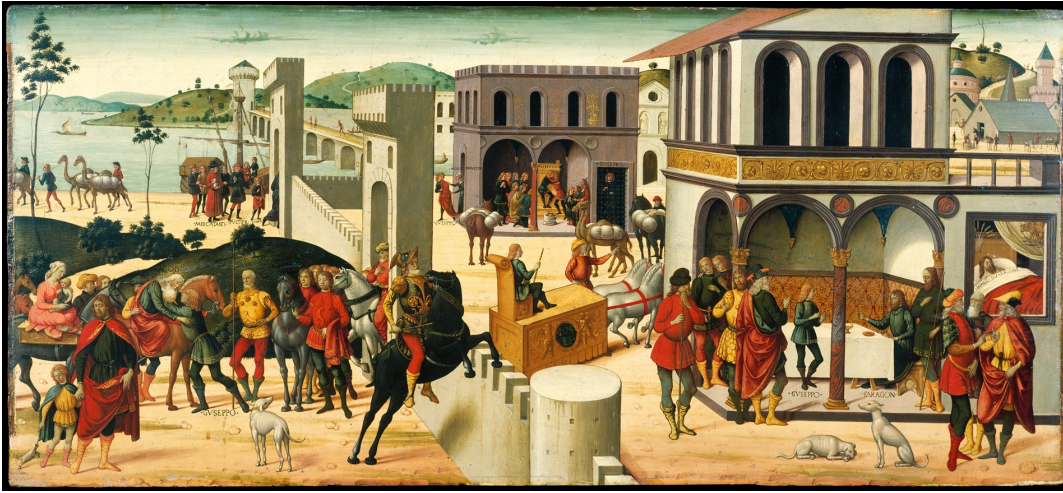
The Story of Joseph Biagio d'Antonio, 1482